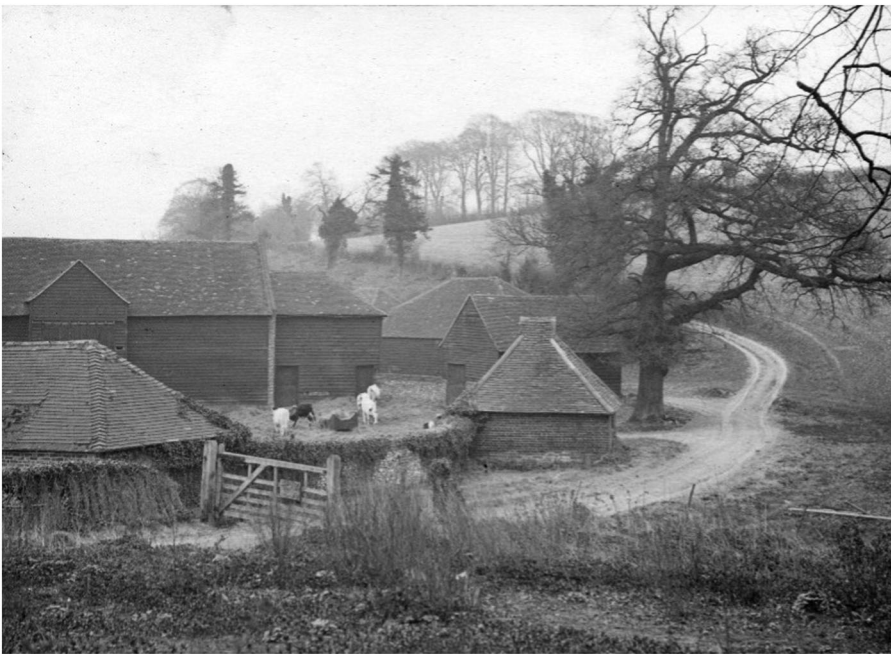
Figure 1. Item 7828/2/94/6. Phoenixe [ sic ] Farm. Postcard, 1926.

The last in this triptych of symbolic Lares is also the best known of Burney’s Surrey domiciles: “Camilla Cottage,” where the author lived almost continuously until 1802, the year in which the family, now expanded by the arrival of baby Alexander in 1794,