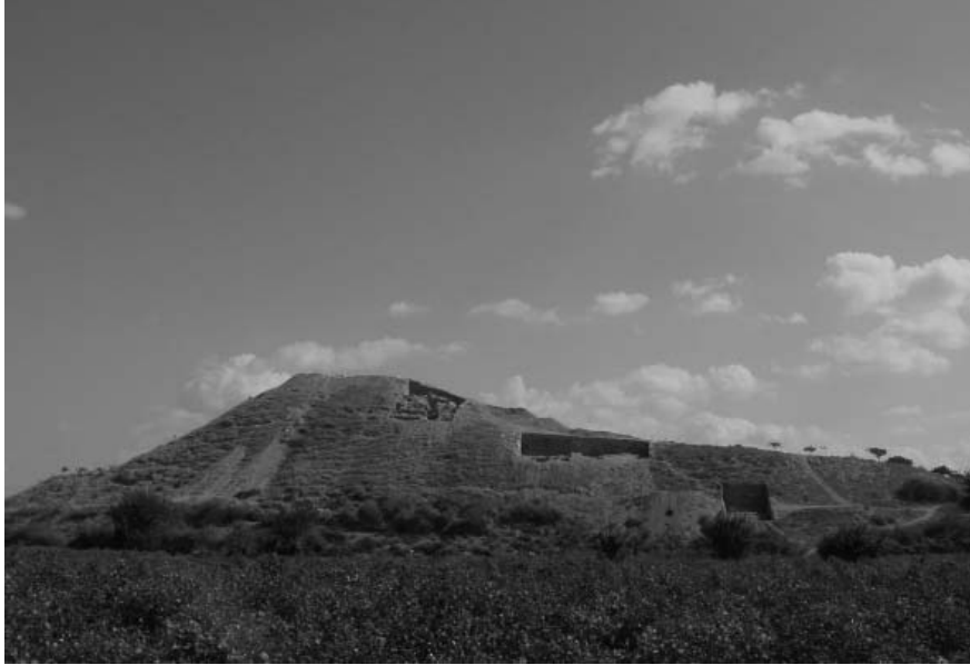
Fig. 1: View of the site of Zeytinli Bahçe from the west.