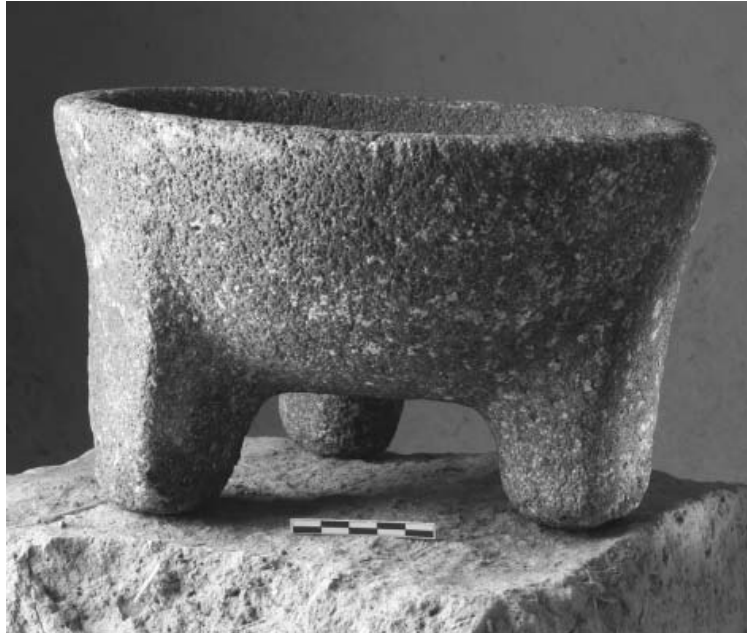
Fig. 5 : Stone tripod mortar, from Room A248.