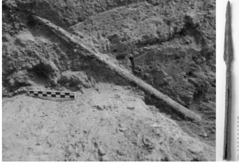
Fig. 3: Spearhead with tubular tang, from Room A287.