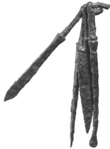
Fig. 4: Group of bronze utensils.